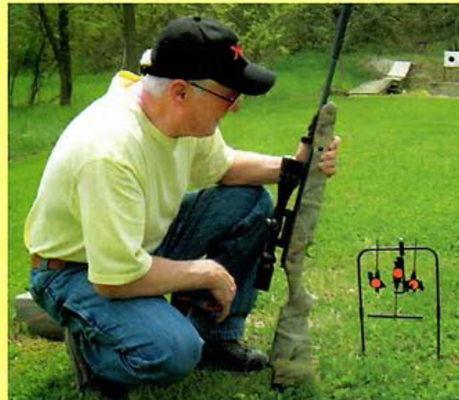
Stoeger's X50 airgun in .177 caliber is no toy and provides performance unheard of in the past.

cally overrun by gray squirrels that not only played havoc with our bird feeders, but also they gnawed into the attic of a neighbor's house while they were on vacation and caused extensive damage. So, with airgun in hand, I declared war on marauding bushytails, and the problem went away. A pellet to the head out to 20 yards worked every time.