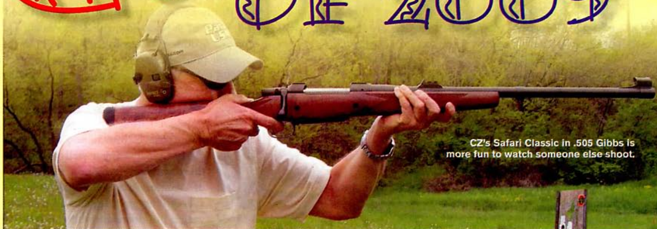
CZ's Safari Classic in .505 Gibbs is more fun to watch someone else shoot.

Each year during the month of May, a whole passel of hunting and shooting industry manufacturers along with writers and editors who turn out a number of InterMedia Outdoors publications (one of which is Shooting Times ) gather at a shooting facility called PASA Park, which is located near the sleepy little farming village of Barry, Illinois. We writers gather there to be introduced to and to wring out a variety of new products, including rifles, shotguns, handguns, optical gear, knives, reloading equipment, clothing, ammunition, and about everything else you can think of. In other words, we have the opportunity to shoot the latest loads in brand-new guns, some of which are wearing scopes that are shown for the first time.